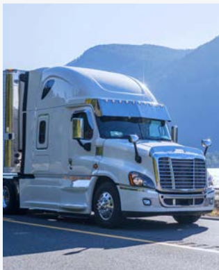
Commercial Driver's License