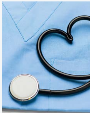
Nursing RNs and LPNs only