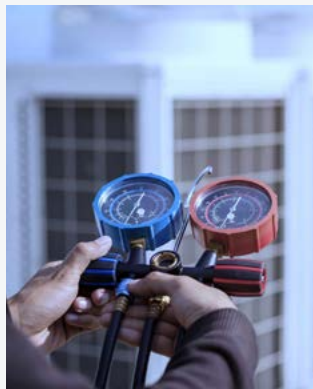
Heating, Ventilation, Air Conditioning